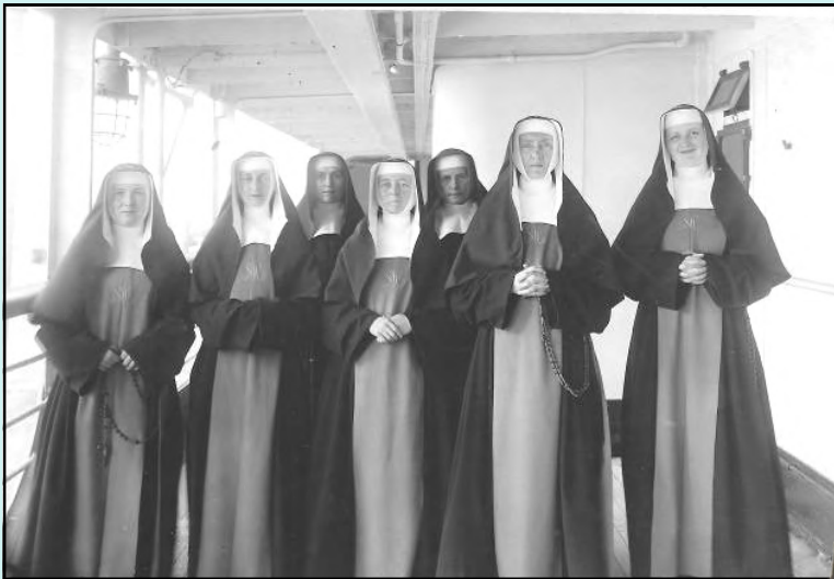
They departed Antwerp by ship on August 12, 1926.

Seven Sisters were chosen for the new apostolate. They departed Antwerp by ship on August 12, 1926. Seventeen days later, after a brief stop in New York and a long train journey across the United States, the Sisters arrived at St. Augustine Parish, Culver City on Sunday evening, August 29, 1926! The pastor and parishioners warmly welcomed the Sisters, providing them with much welcomed food and rest. Since school was to begin in a week's time, some very kind Sisters from local schools came to help... providing assistance in the basics of Catholic education in the American system, e.g., set-up of classrooms, curriculum, discipline, etc. On Tuesday, September 6, 1926, the Sisters were ready, and St. Augustine School opened its doors to one hundred and twenty-three students! In the ensuing months and years the students at St. Augustine School were on a par with the surrounding schools. The name of St. Augustine School was well known for its scholarship and leadership.