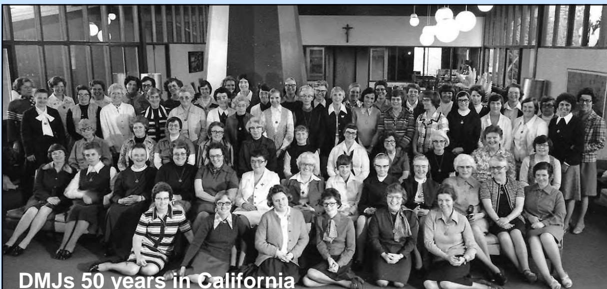
DMJs 50 years in California