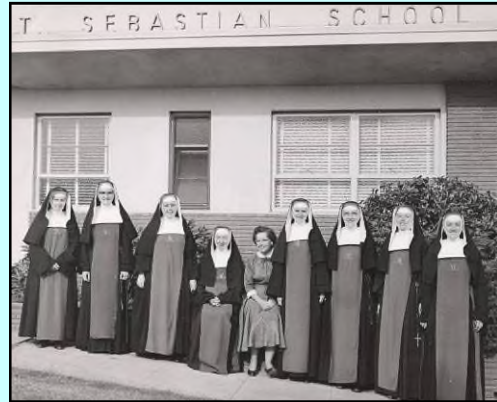
St. Sebastian School, Los Angeles