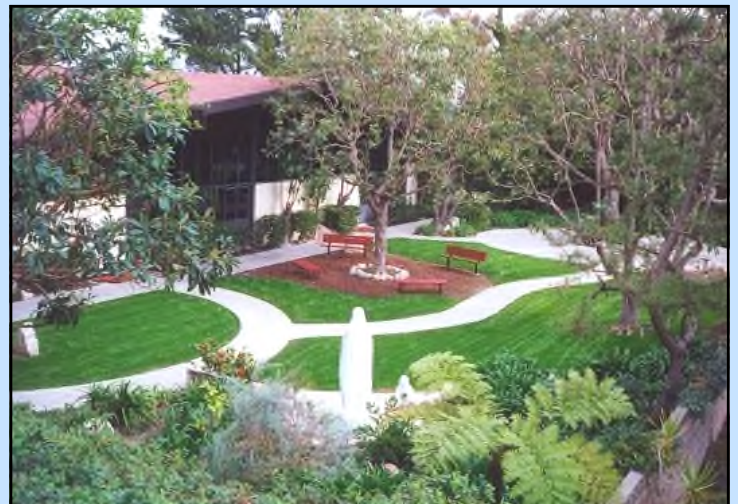
Mary & Joseph Retreat Center today