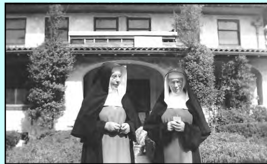
Precious Blood School, Los Angeles