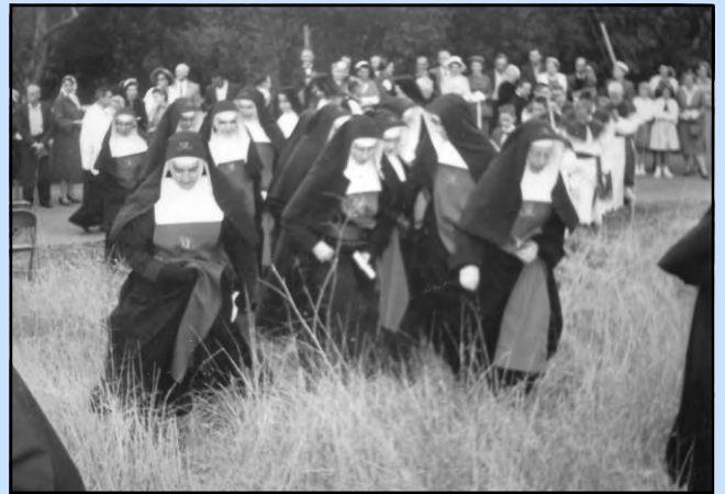
Ground Breaking in Palos Verdes for Novitiate