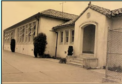
St. Michael School, San Francisco