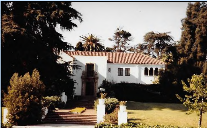
San Vicente, Brentwood: First Novitiate