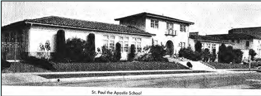
St. Paul the Apostle School