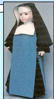
Our Lady of Mount Carmel, Mill Valley