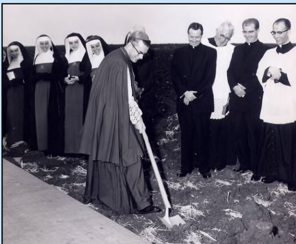
Ground Breaking for Mary & Joseph Retreat Center