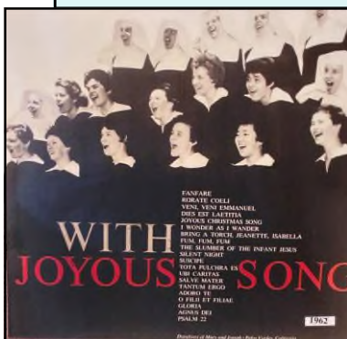
1962 First Novitiate Group in Palos Verdes.