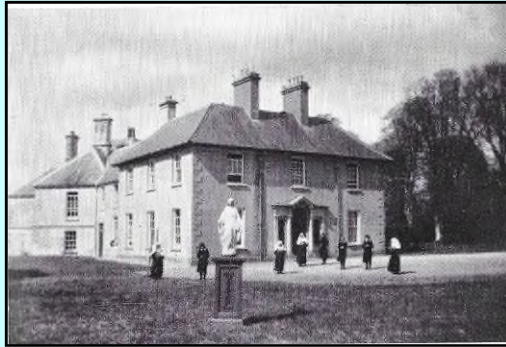
Castlecor Novitiate, Ireland